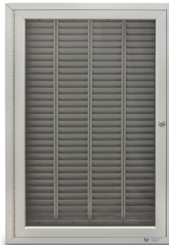
UV4221 120 Badges