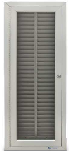
UV4220 60 Badges