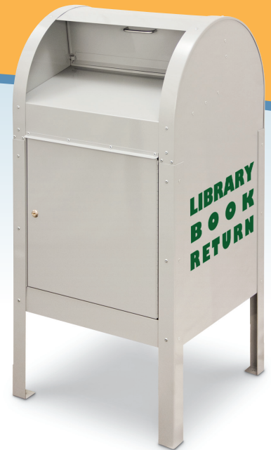
UV4687 White Curbside Collection Box

These units are made for private use only — no exceptions. Collection boxes are excellent for bill payment drop off, night depository, video, or book drop. The standard color is white, with custom colors available at an extra charge — Blue is not a color option; additional charges may be incurred for an exact PMS color match; please call our Customer Service Department for details on custom colors. Custom color drop boxes are not returnable. Each unit comes standard with a 5-pin tumbler lock and two keys.