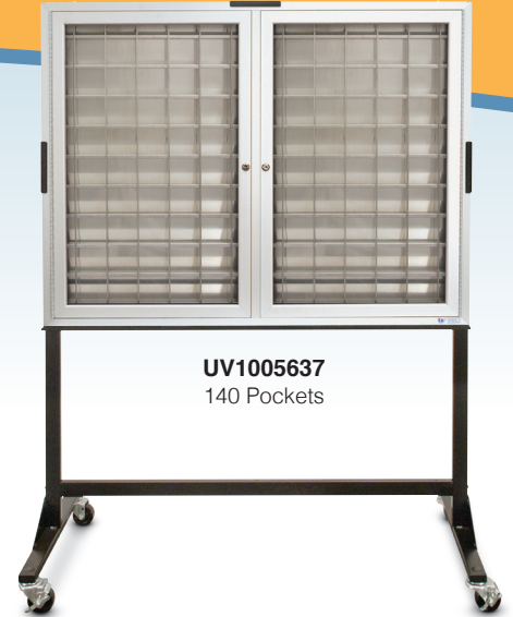
UV1005637 140 Pockets

All Aluminum Construction is Durable Enough for Plant Floor