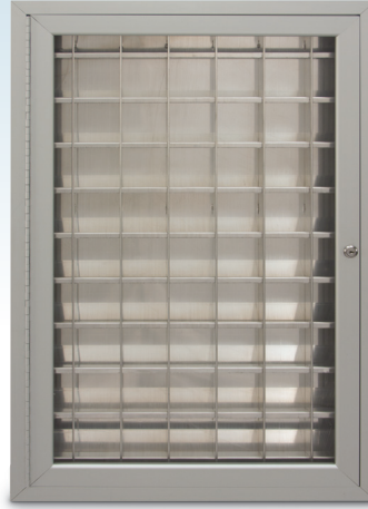
UV1005634 70 Pockets